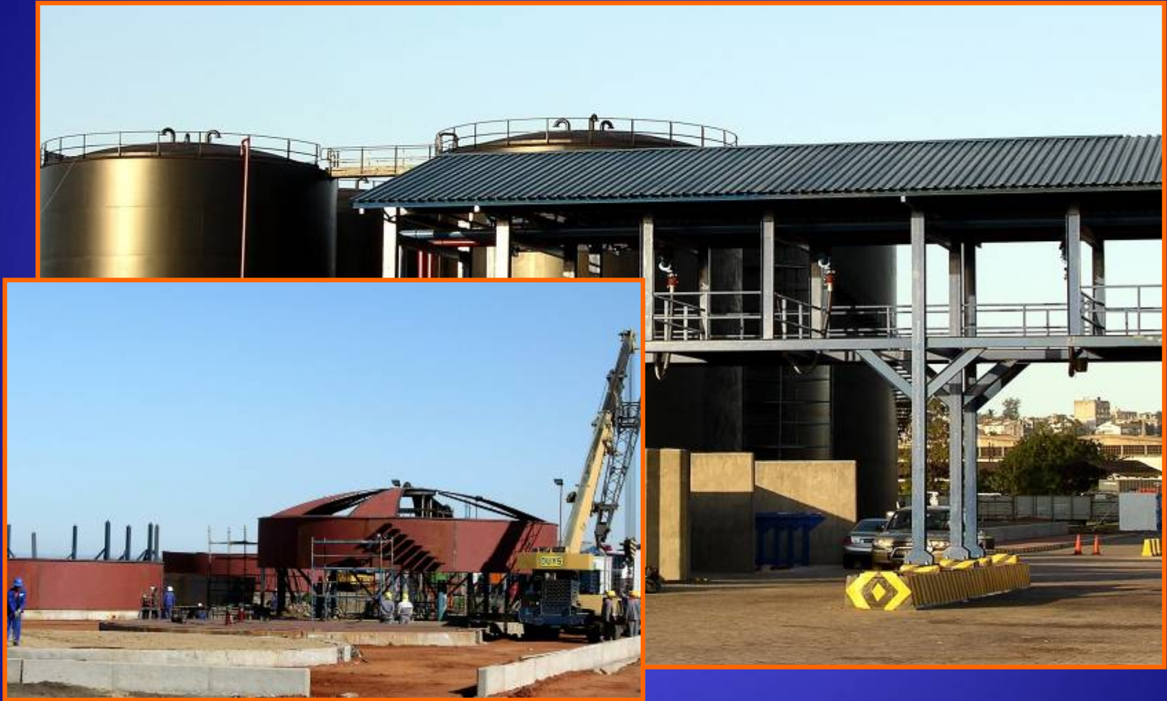
2008 - PHASE 1 BULK LIQUIDS TERMINAL FULLY OPERATIONAL