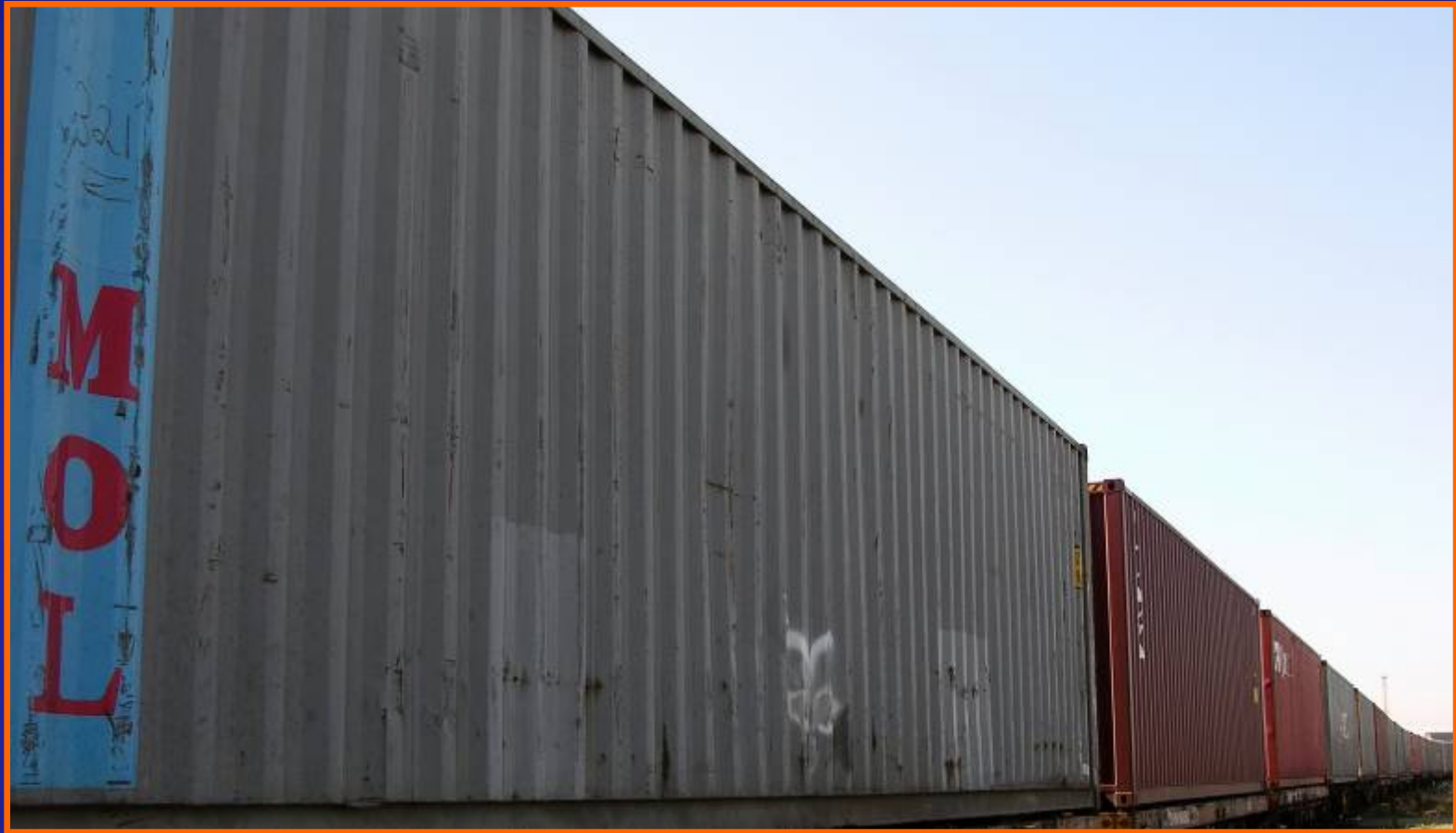
2008 - CONTAINER TRAIN APPROACHING MIPS