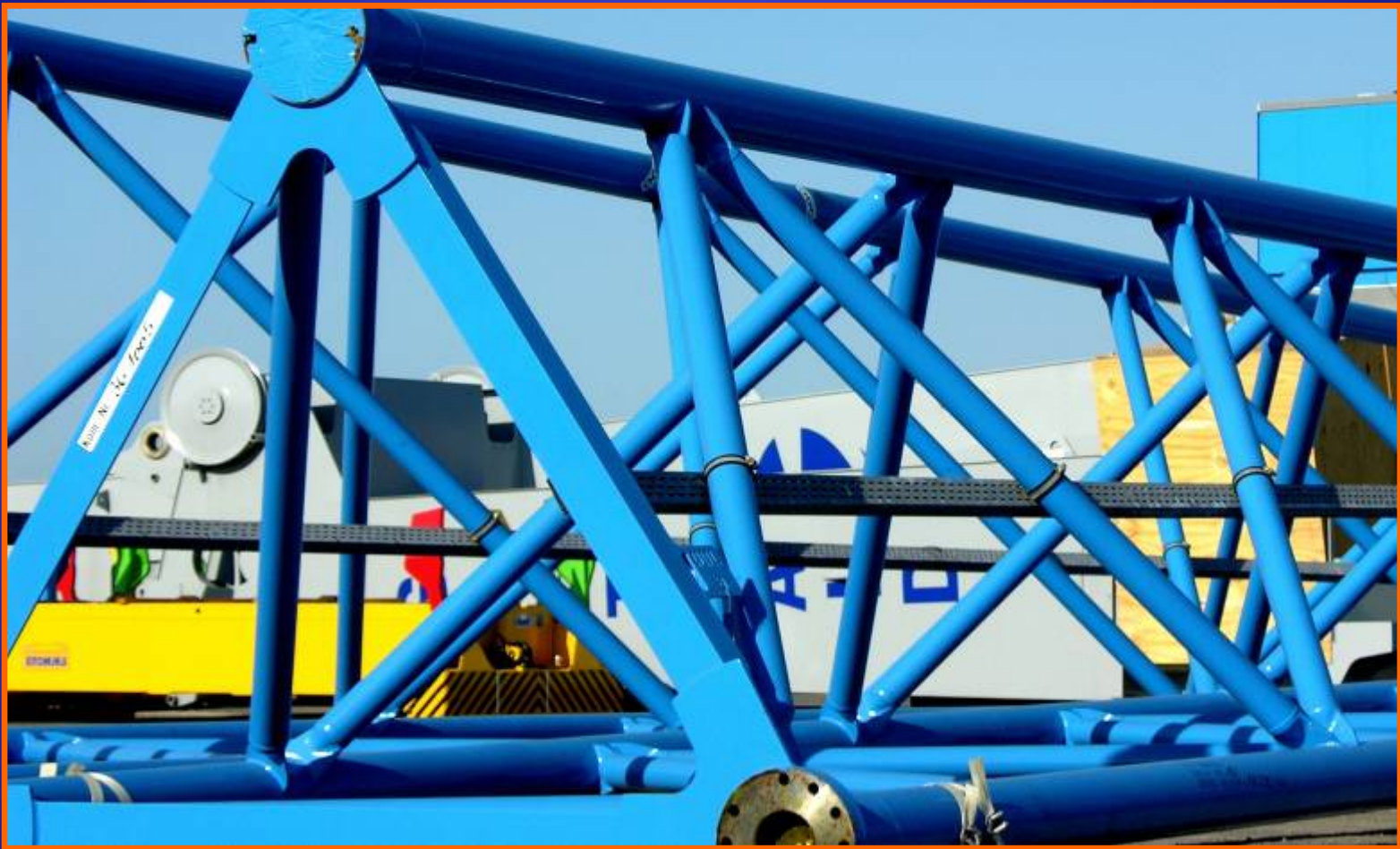
2008 - TWO GOTTWALD MOBILE HARBOUR CRANES DELIVERED TO MIPS