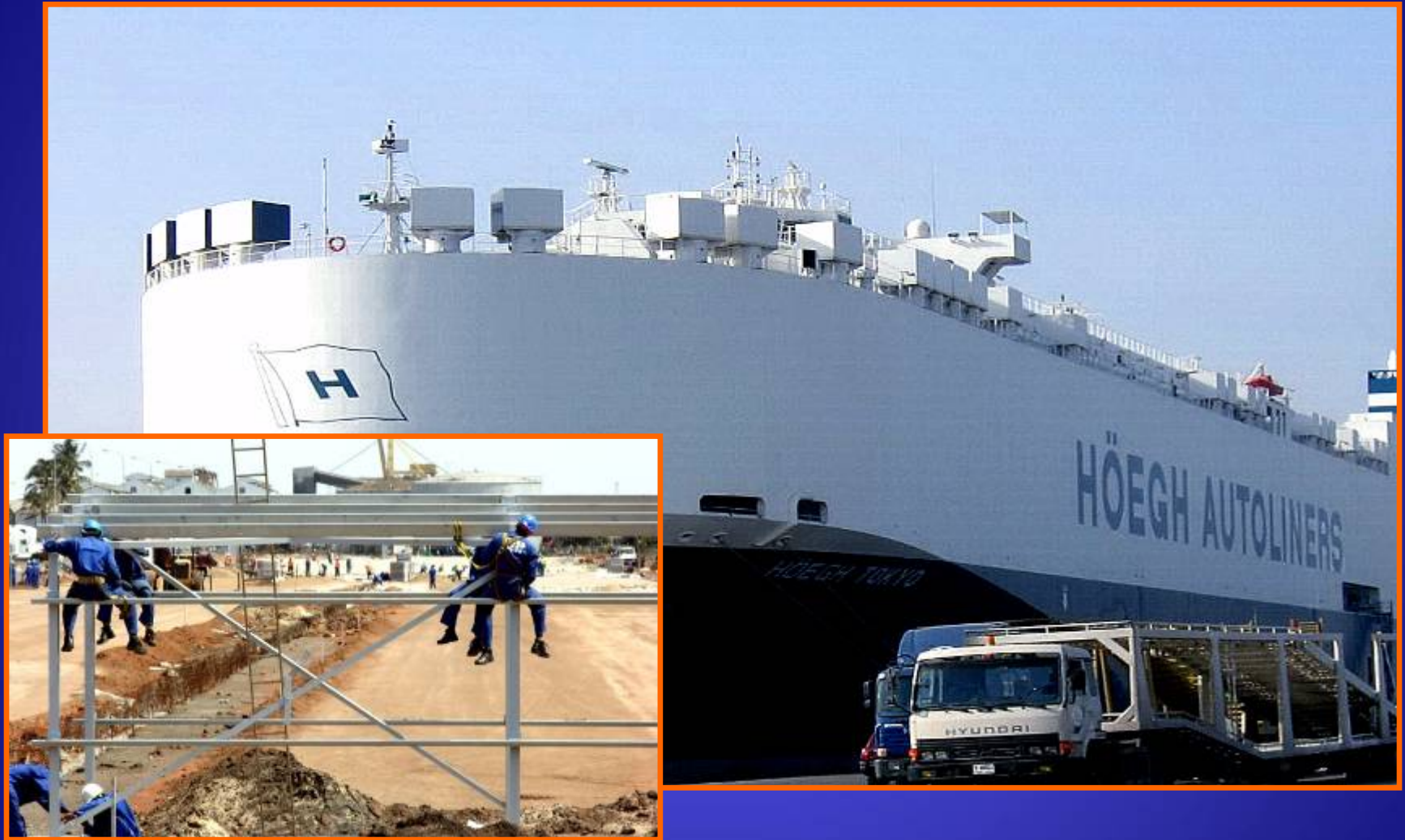
2008 - HOEGH AUTOLINERS STARTING AUGUST 2008