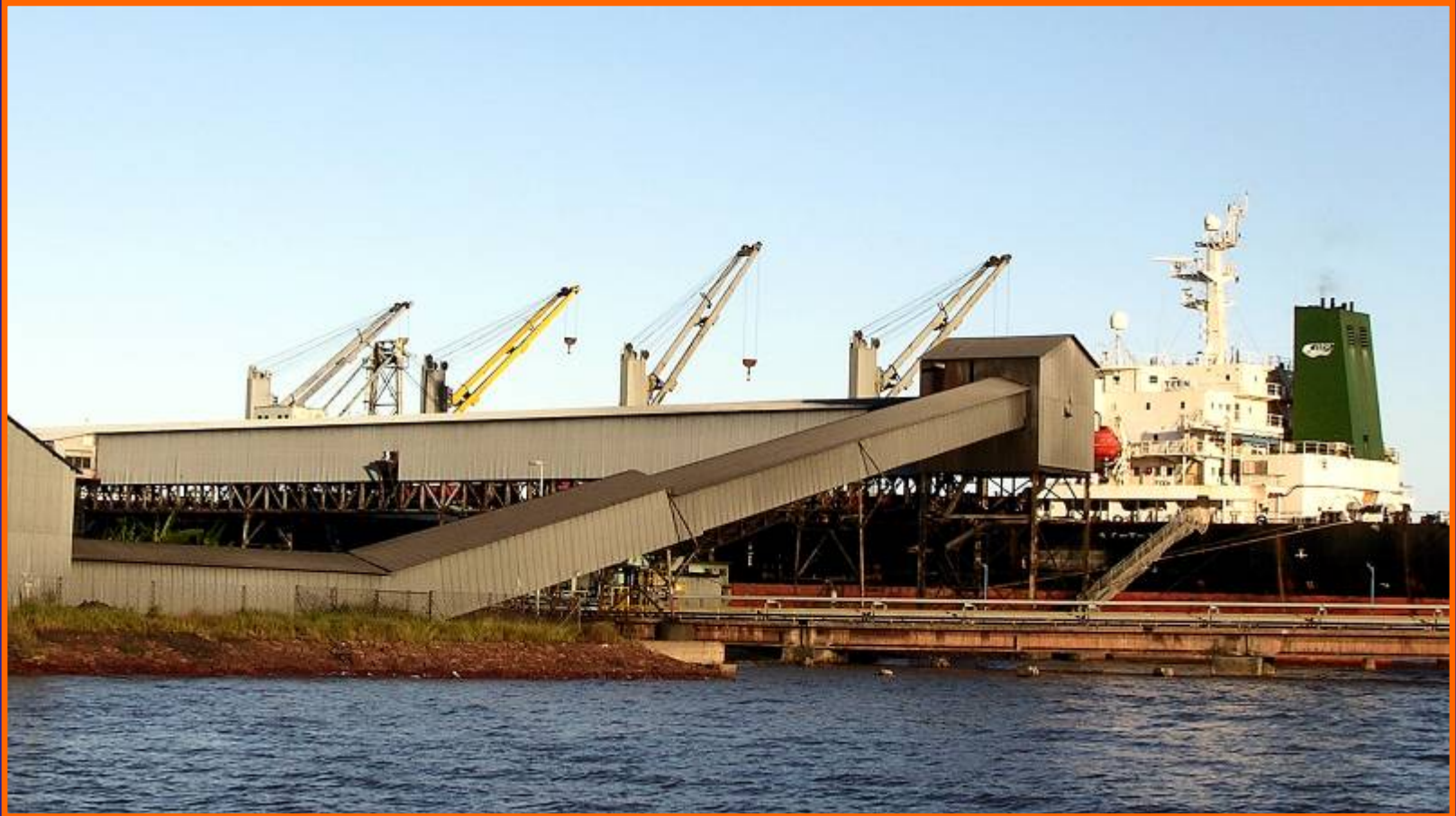
2008 - MODERNISATION OF THE MATOLA COAL TERMINAL