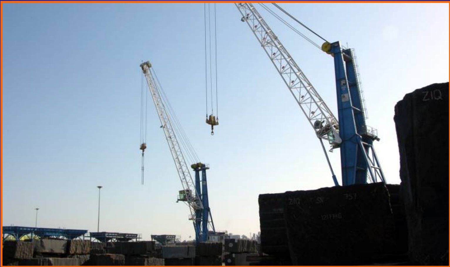
2008 - TWO SMALLER FANTUZZI CRANES HANDLING GRANITE