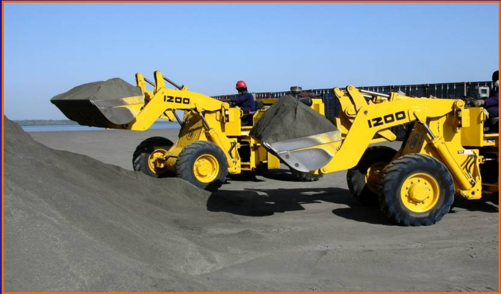
2008 - NEW FERRO-CHROME HANDLING EQUIPMENT